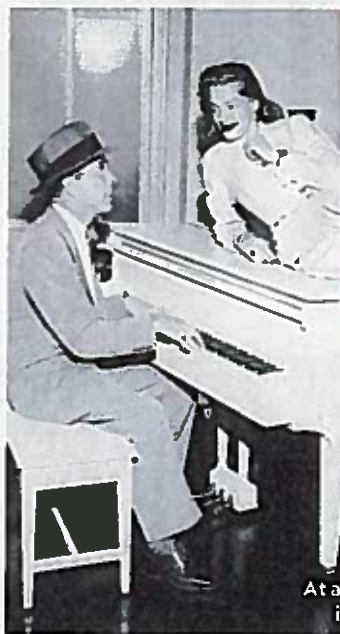
Ca. 1949 At a press event in New York.