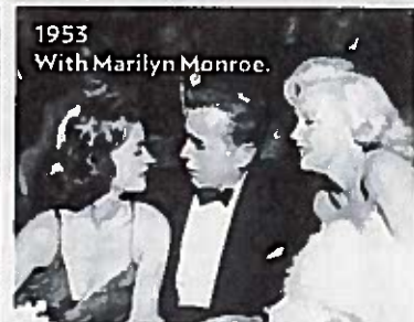
1953 With Marilyn Monroe.